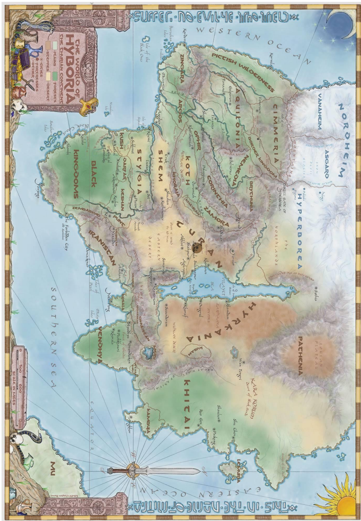
Figure 0: The World Map——Zamboula, Turan