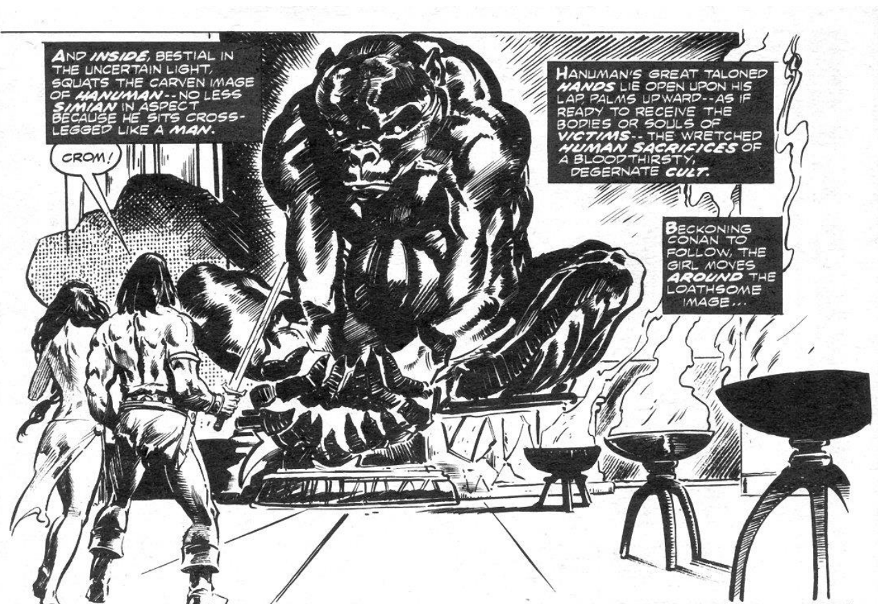
Figure 3: Hanuman the God