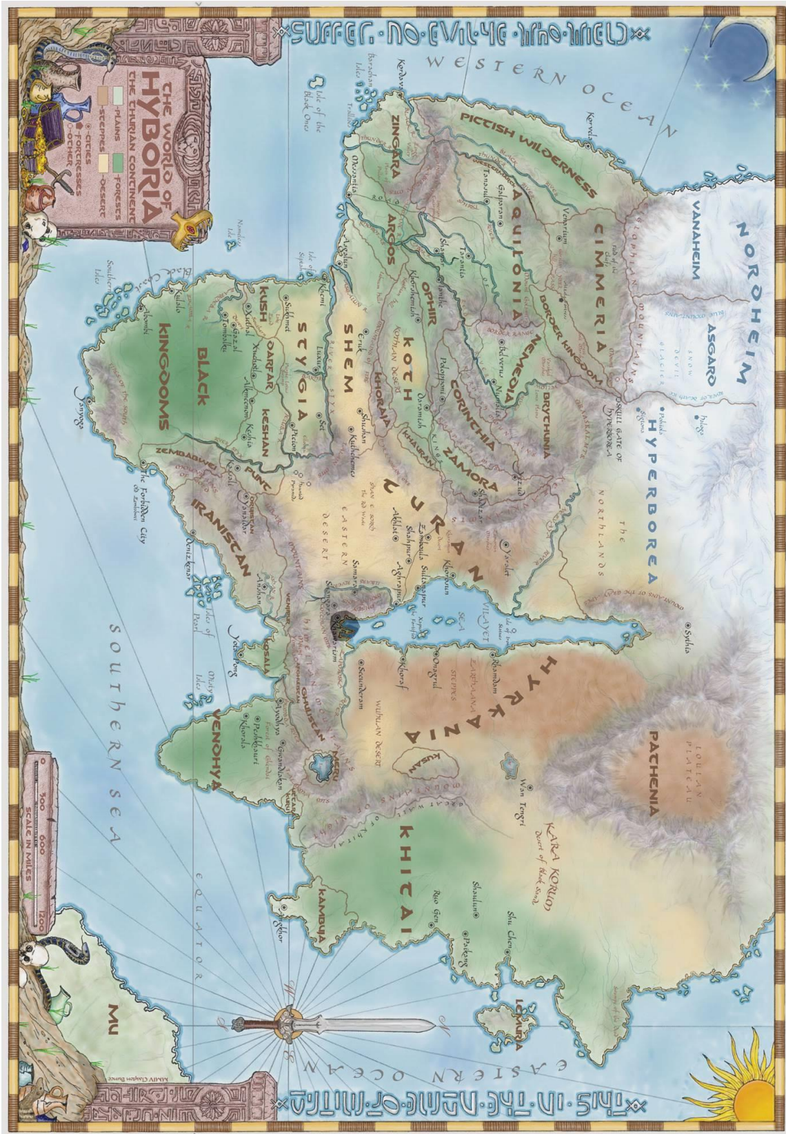
Figure 0: The World Map---Khawarizm, Turan